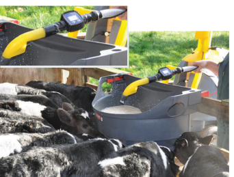
The flow meter measures the volume.