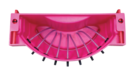
265-3009 - Inside view

Patented Milk Bar Teats promote slow-nursing for maximum salivation, healthy digestive development and a minimum of choking and guzzling. When the salivation urge is satisfied, animals are more content and the enzymes and natural antibodies in the saliva help calves build digestive health and a strong immune system. Nipples require no valves or tubes and fit in a 7/8" hole. Nursers come complete with nipples as shown.